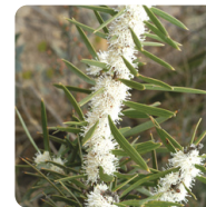
Western Furze Hakea