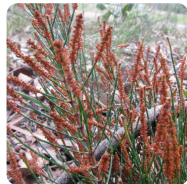
Small Sheoak - male