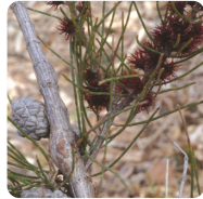
Small Sheoak - female